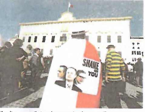
"Aren't you angry that crooks are running the country?" A protester at an anti-corruption protest held in 2016.

So why is Schembri's surrender so spectacular? For one main reason that needs to be emphasised and that many are missing: A few minutes before Caruana